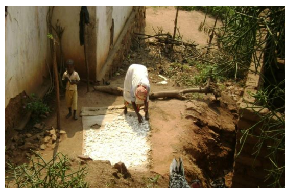
Young woman sun-drying the bitter raw cassava for her daily meal