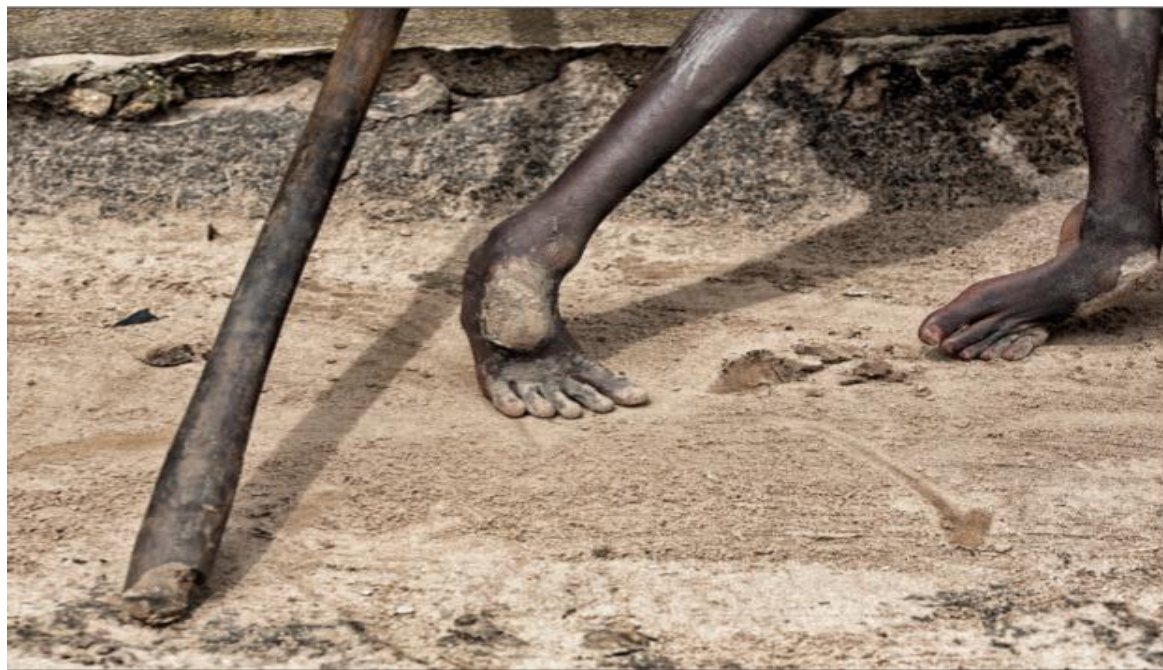
Konzo, a forgotten disease in DR Congo

2 NLR-Netherlands Leprosy Relief, Mozambique