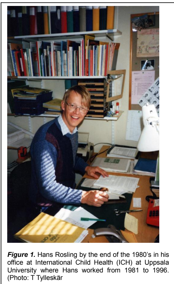
Figure 1. Hans Rosling by the end of the 1980's in his office at International Child Health (ICH) at Uppsala University where Hans worked from 1981 to 1996.

During the next two days, the patients continued to come. When looking at the overview of the patients, Hans noticed that the number of new cases doubled every week. It was not necessarily biological warfare. There had also been a severe drought in 1981. There was severe food shortage. People had started to eat wild plants. Could it be that any of